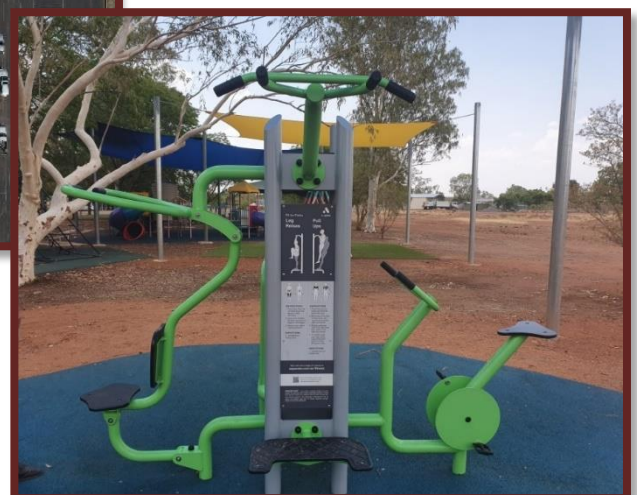
Florence Clark Park Redevelopment Project and Mary Kathleen Park Exercise Station completed in 2020.