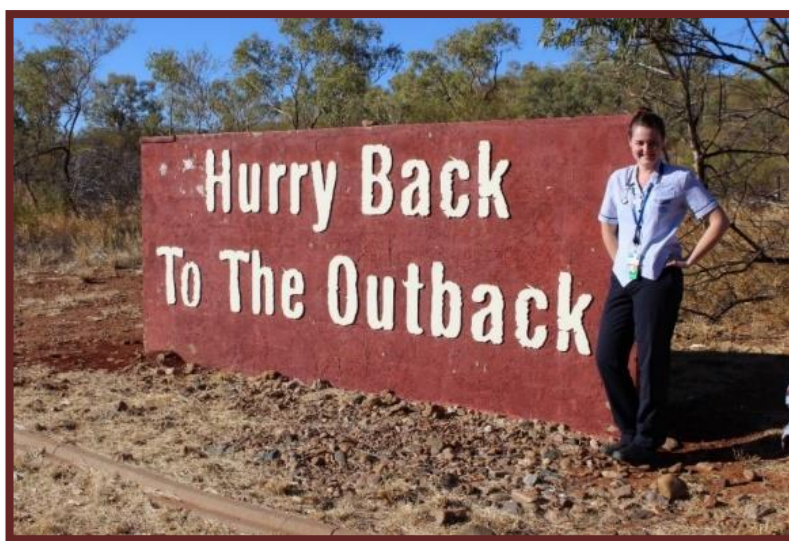
Received: JCU Centre for Rural and Remote Health

*Note that Cannington Mine (South32), Phosphate Hill (Incitec Pivot), and Ernest Henry Mine (Evolution Mining) were also invited and attended, providing significant input and wisdom. As they are not dedicated health and wellbeing agencies, they are not further discussed in this document, but Cloncurry Council acknowledges their contribution to the Shire and the need for health and wellbeing planning to include consideration of these and other significant employers.