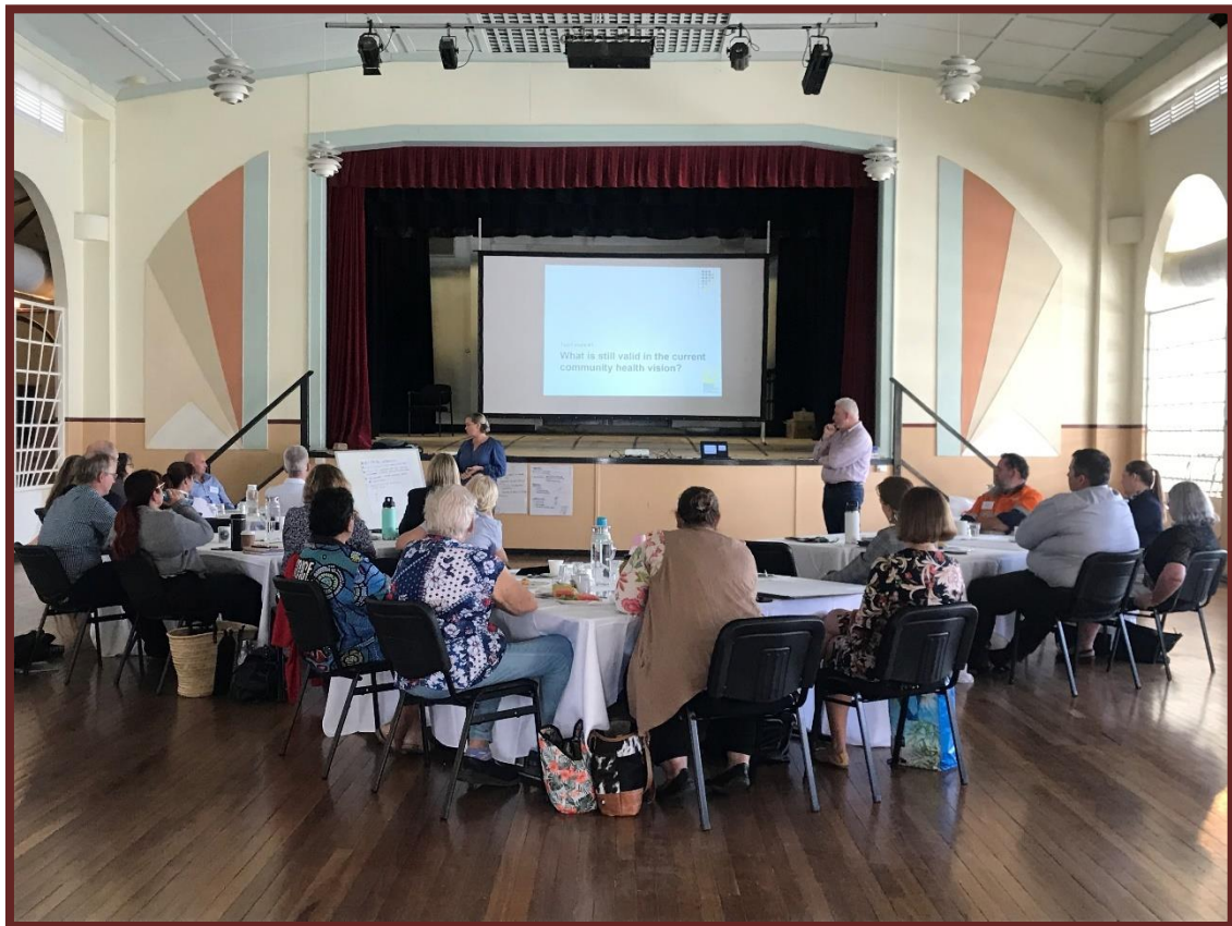
Health Vision Workshop held on 26 May 2021 in the Cloncurry Shire Hall.

Follow up meetings were held with individuals and organisations to provide more in-depth information or clarification of comments or proposed solutions.